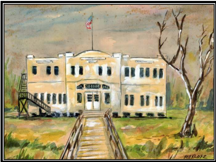
Old High School, Everglades City

Incoskope, Deputy Sheriff Trees with Brush Fire Tree with Nest