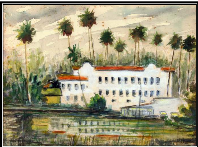
Old Hotel Building after Heavy Rain